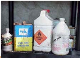
Just a small sampling of hazardous household items.

Hazardous wastes are typically found in your basement, garage, under the kitchen sink, craft area, or workshop. They are used to do things like clean, repair,