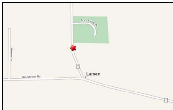
Town of Clayton Public Works Department 8348 County Road T, Larsen April 20, 9:00-11:00 AM