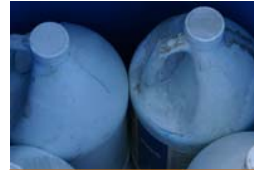
Hazardous items disposed of properly during a Clean Sweep.