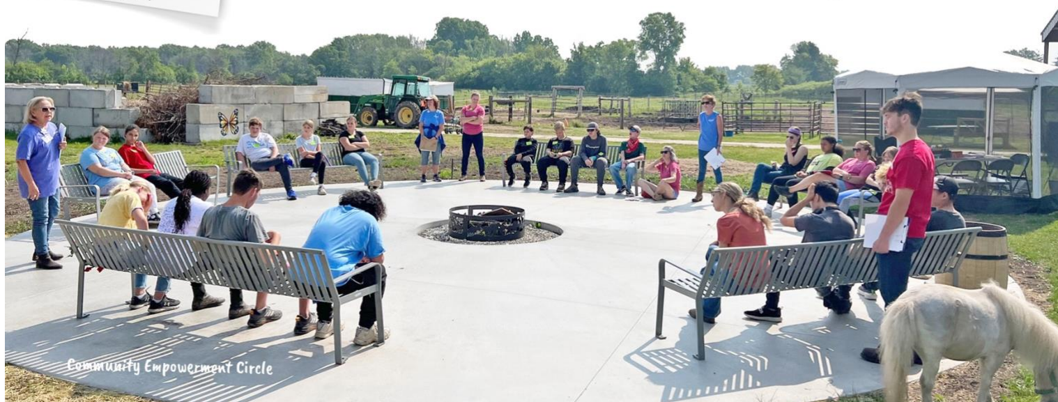
Community Empowerment Circle

We welcomed a new PATH-certified instructor and a grant writer