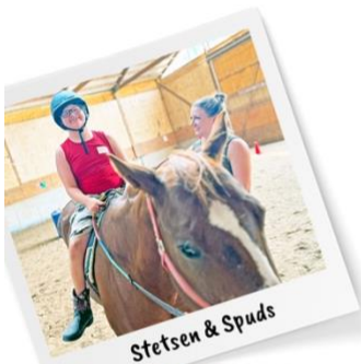
Stetsen & Spuds