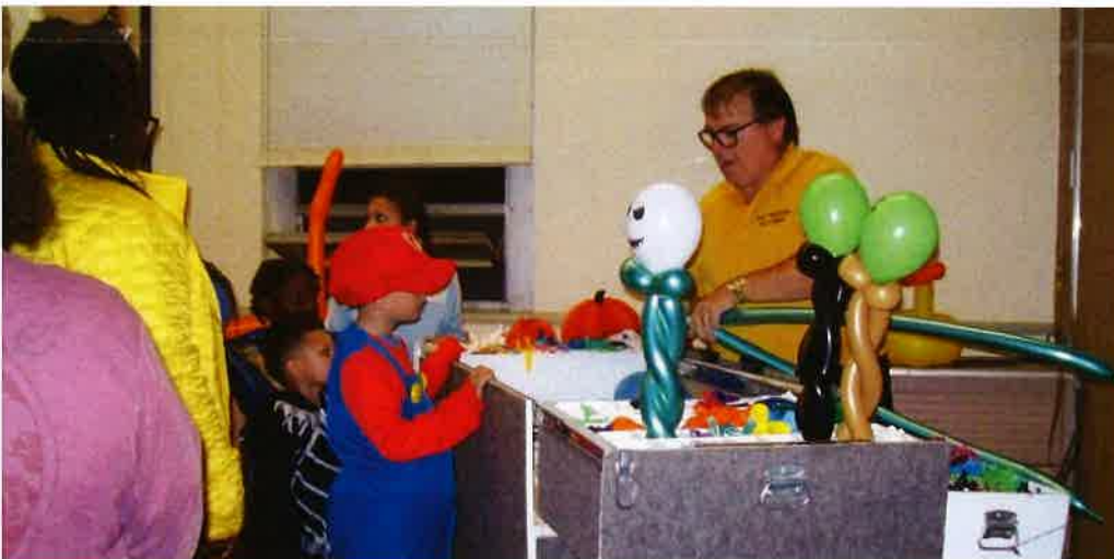
Thank you to Half Twisted Half Knot for your exciting balloons.