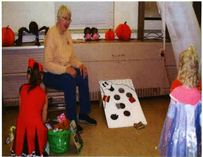
Thank you to all who helped with the games and foods this year.