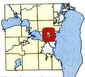
Winnebago County Wisconsin

County Highway Y Project Block Group 2, Tract 17