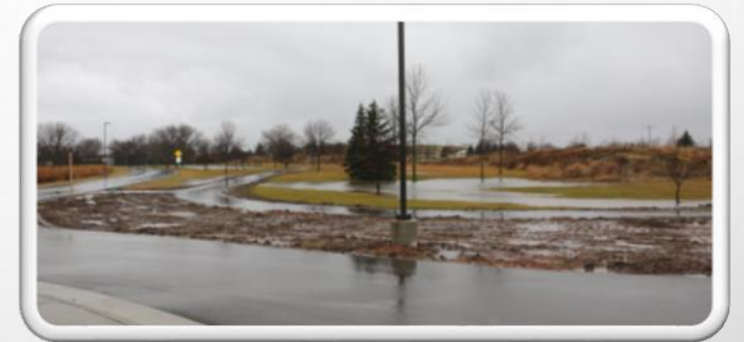
MAIN ENTRANCE CTY Y