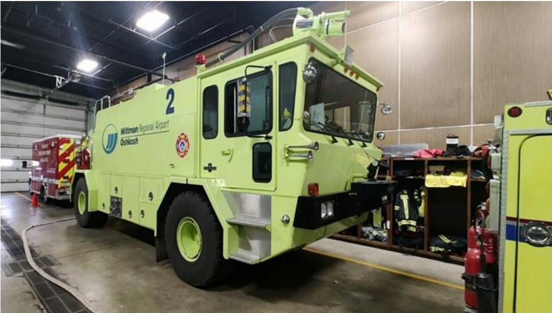
1986 – Oshkosh T-1500 (existing)