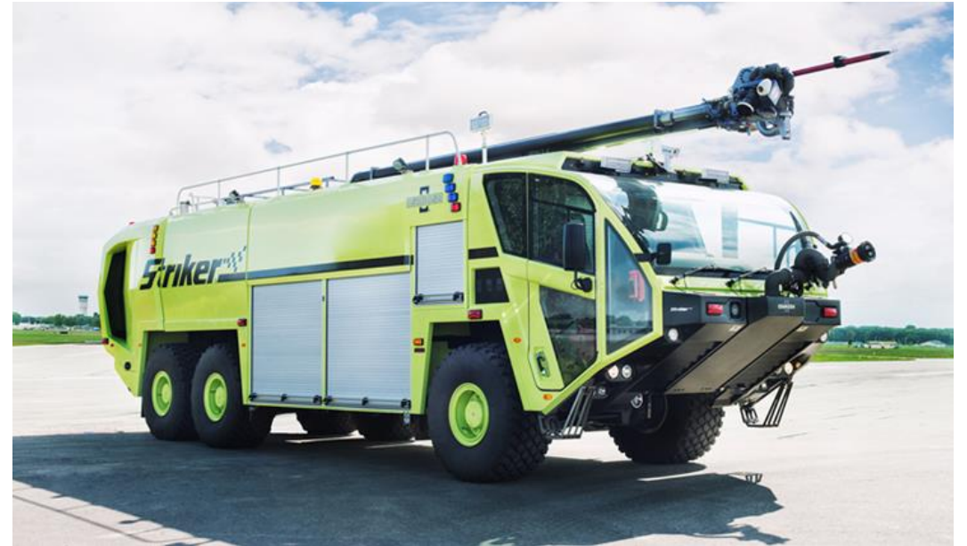
Example of a new Oshkosh Striker