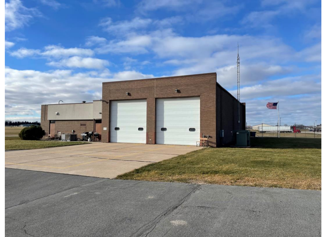
From Airfield – looking West