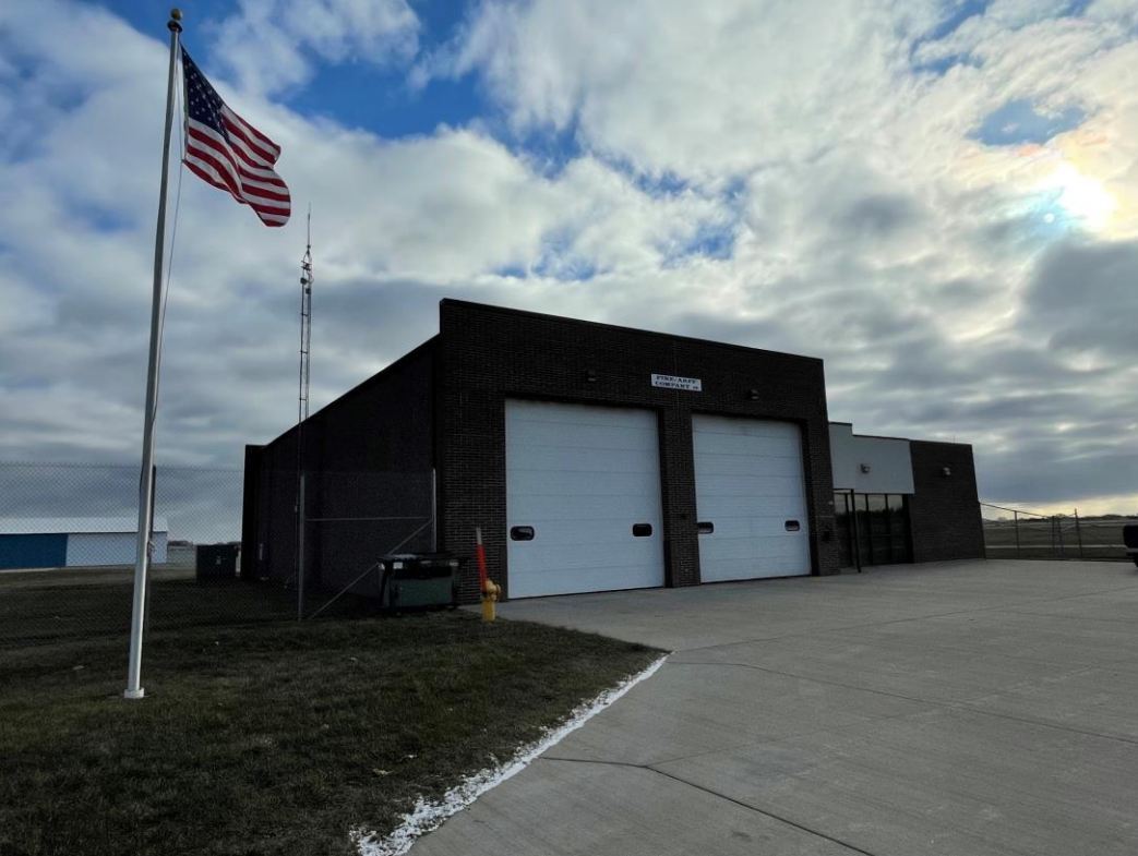
From Knapp St – looking East