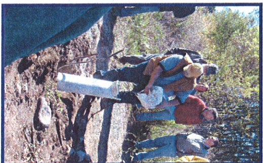
Bentonite chips being poured into a well during abandonment.

Well abandonment projects need to be completed by a licensed well driller or pump installer to be eligible for cost sharing.