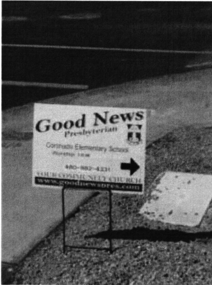
Alliance Defending Freedom

Town proved unsuccessful. The Church sued the Town arguing that the Sign Code abridged their freedom of speech in violation of the United States Constitution.