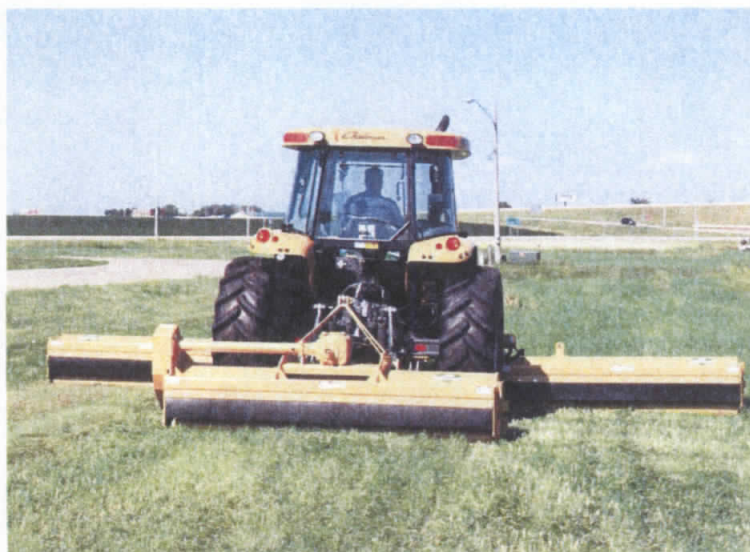
Diamond Triple Flail Mower