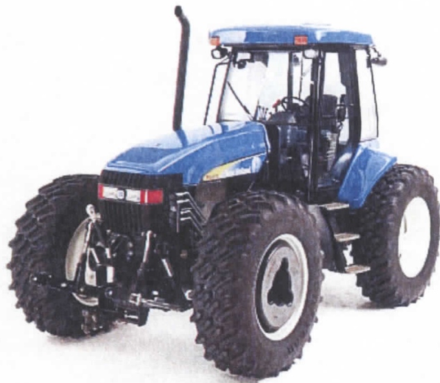
New Holland TV6070 Bi-directional Tractor

These units would be purchased with funds from the airport's undesignated fund balance.